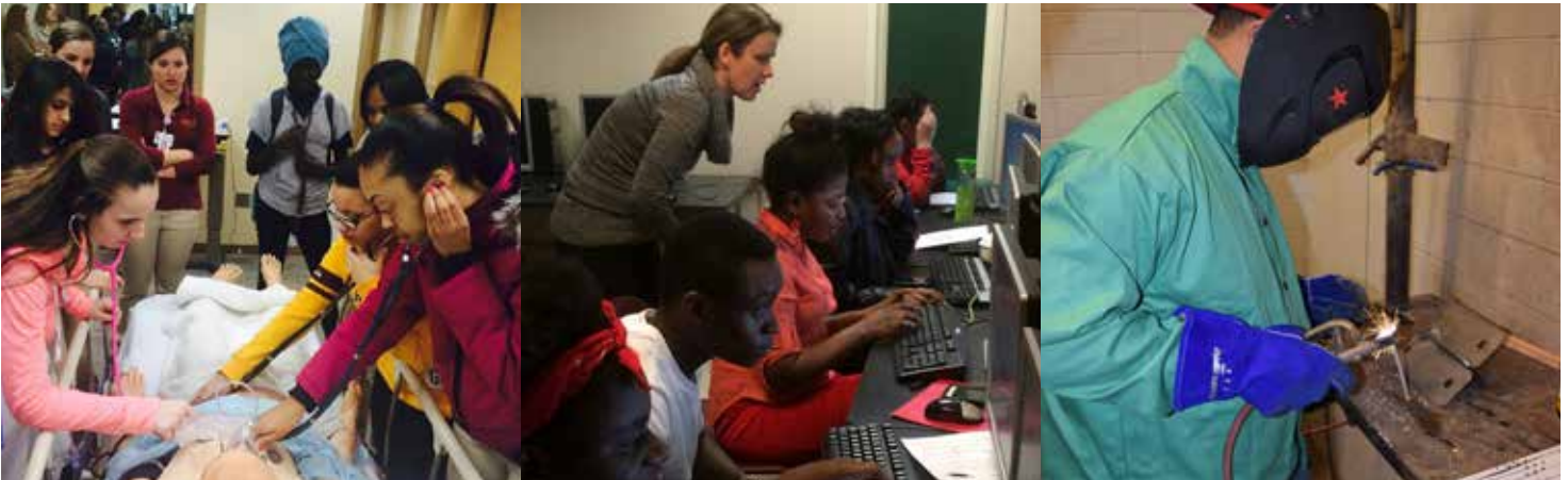
GO College and Tech After Hours