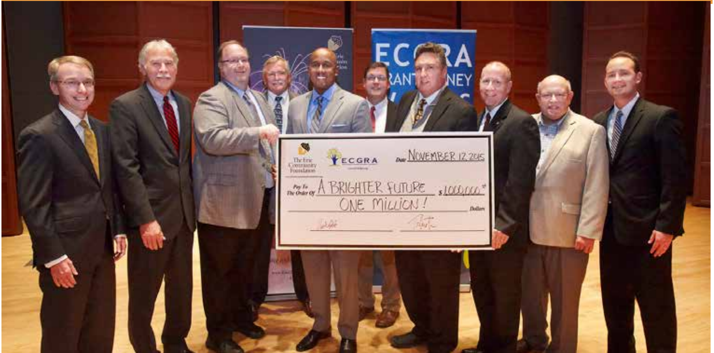
ECGRA and The Erie Community Foundation officials celebrate a $1 million collaboration for Youth and Education.