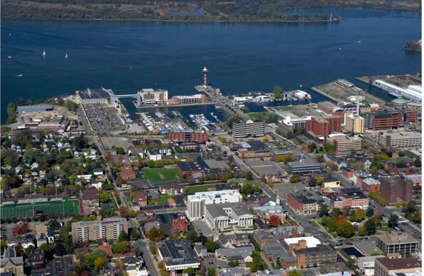
Aerial of the city of Erie and waterfront by Mark Fainstein Photography.