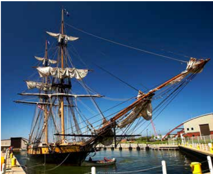
US Brig Niagara in its home court.

For the 72-passenger Food + Fun bus used to feed and provide enrichment for children in Erie's food deserts $10,000